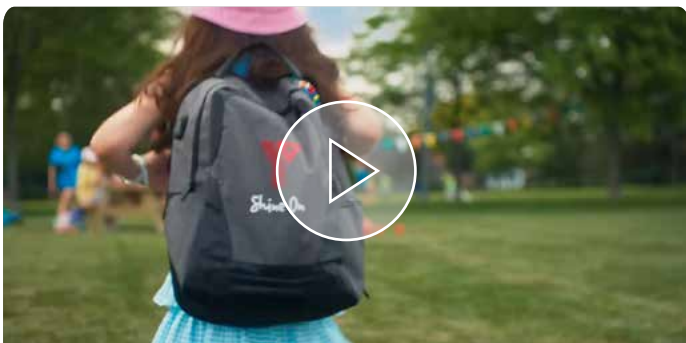
The full length video

The campaign has two main areas of focus: brand awareness and fundraising. The spots highlight the wide variety of programming available at the YMCA and raise awareness of our charitable status. To capture the energy of the YMCA, a new, custom song was created. Its dynamic sound is designed to grab attention, bring a feeling of energy and joy, and help our campaign break through the noise in a very competitive marketplace.