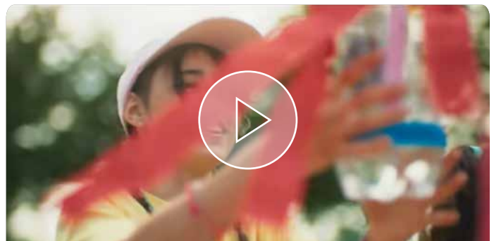
30s Fundraising video

Although our campaign reflects our vision and message for Canadians across the country, its execution may vary by region due to several factors, such as audience concentration, budget, market relevance timing, etc. The campaign will be running in English language markets across Canada, except in Quebec.