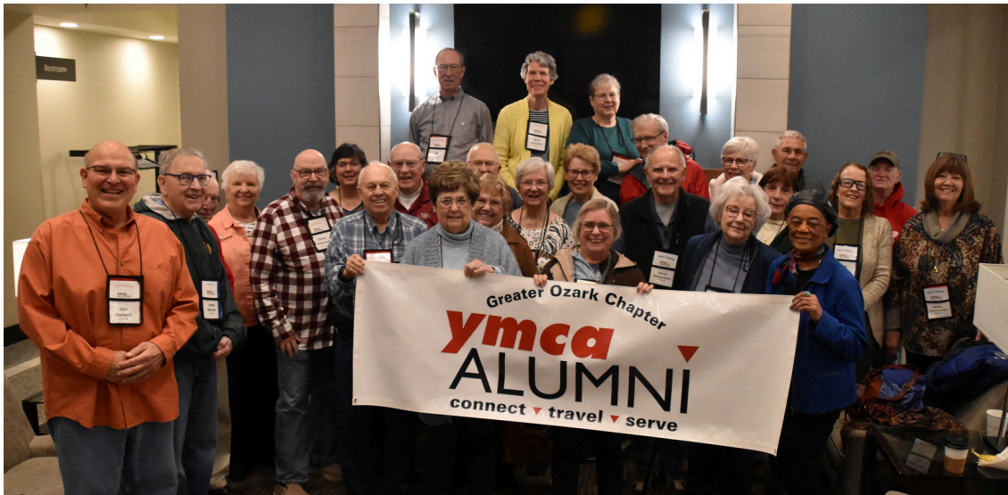
Members of the Greater Ozark and Mott chapters gathering in St. Charles, Missouri, in April. Wet weather didn't keep us from exploring the history of this early river town.