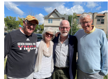
World Service Workers 1974-1976 gather for lunch in Minneapolis