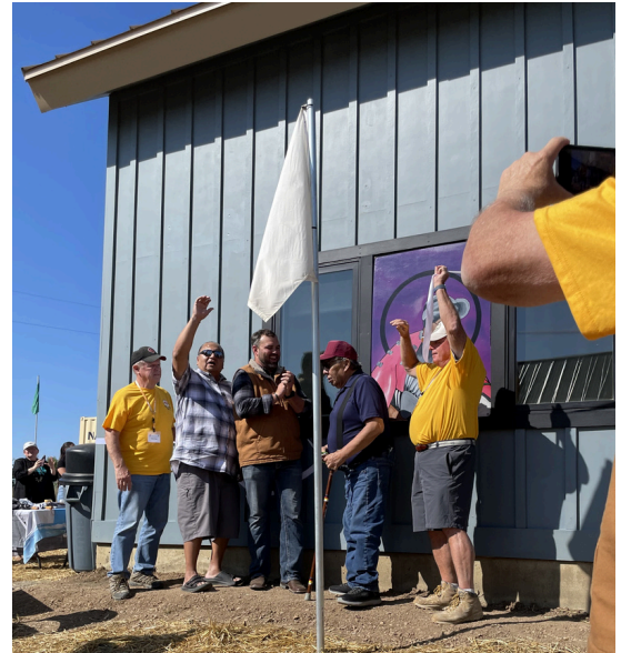
Ribbon cutting for North home with elders volunteers and Y CEO

Ribbon cutting & dedication Sept. 21, 2025