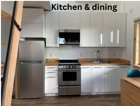
Kitchen & dining