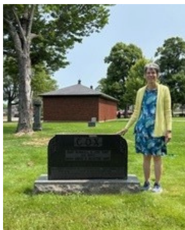
Nova Scotia trip to find her roots