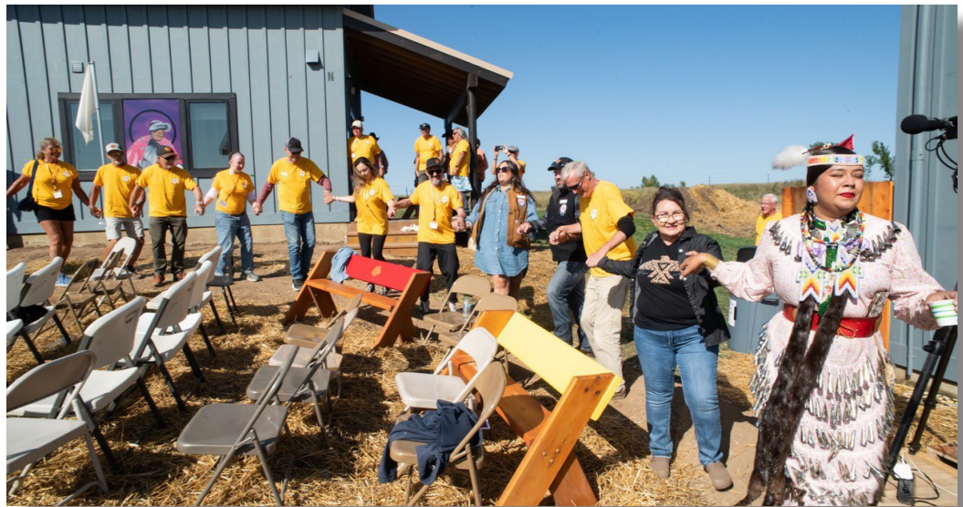
Opening Celebration