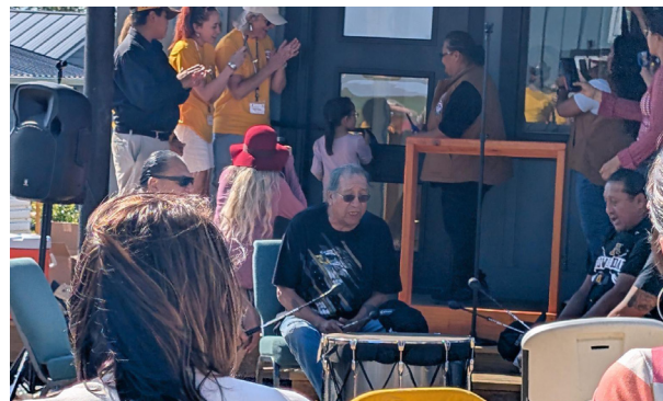
Lakota Drum Group entertains the guests

The tiny homes are considered "passive structures," meaning they use natural influences like sunshine and ventilation to maintain climate control and use up to 90% less energy than conventional homes. The 493 square foot homes include fully equipped kitchens, sleeping quarters, washer-dryers, TVs, internet connections, etc.