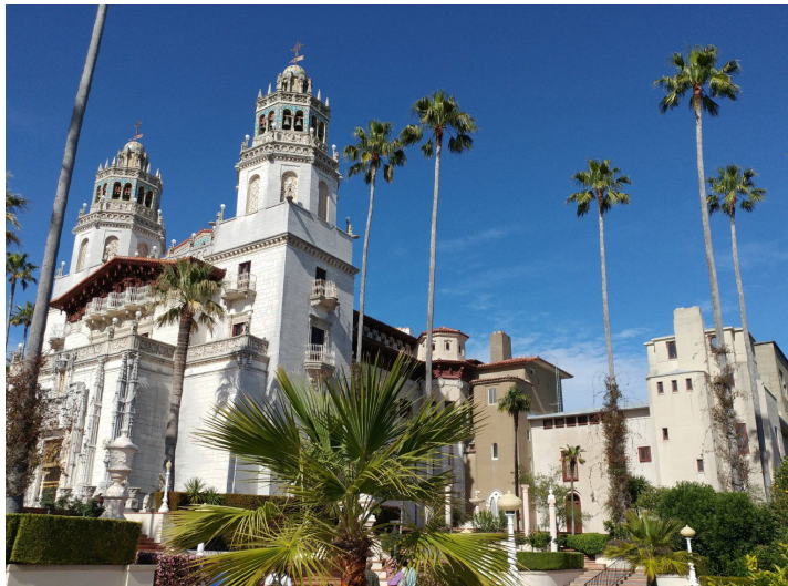
Beautiful Visit to Hearst Castle.