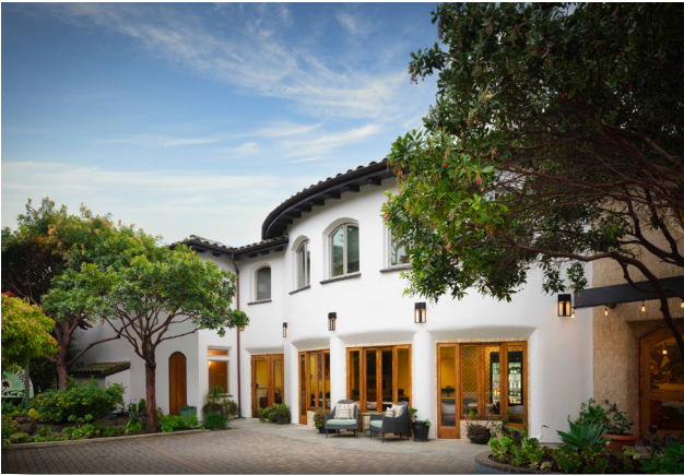
El Colibria Hotel and Spa