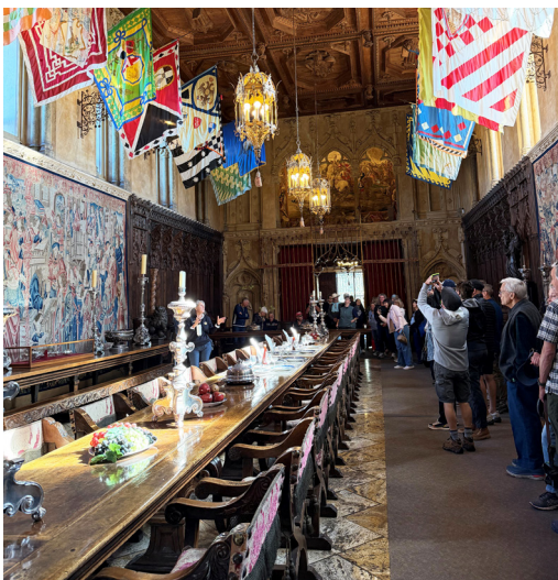
Our group touring the Grand Dining Room (below)

That afternoon was free for the group to take leisurely strolls through Cambria's charming shops and galleries, where handcrafted goods and coastal treasures tempted their pocketbooks.