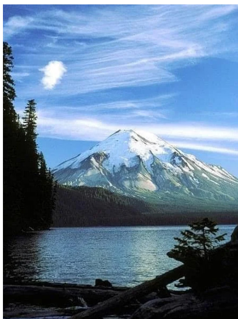
Mount St. Helens before eruption in 1980

center, now located behind where Camp Meehan once existed. The Longview YMCA camp also has memorabilia in several locations. If you have plans to travel in Washington state, these would be great places to visit.